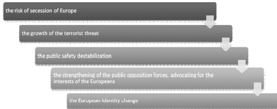
Figure 3: The negative effects of the migration crisis in Europe

Considering the migration crisis in Europe, the following negative effects can be identified (Figure 3. The negative effects of the migration crisis in Europe):