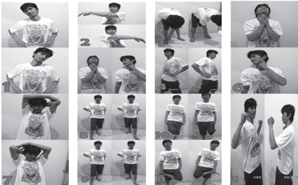
Figure 2: Stretching movement

Stretching is done 2 times a day, held in rest place (base) in a standing position for 5 minutes and 5 minutes of rest, without music. Stretching movements include movements for neck, back, hands, fingers, hips and legs (see figure 2): for neck flexibility (1) (5) (6): moving the neck left to right, fore-rear and left-turning head to right, then rotate the head from right to left, for 75 seconds; for back flexibility (2) (4) (12): rotate the hands with a bent position from front to back, and then vice versa, right hand left-aligned moves left to right, for 75 seconds, for hand flexibility (3) (7): moving the hands forward backward a straight position by hand parallel to shoulder, the hand position flexed moved forward and backward for 75 seconds, the leg flexibility (8) (9) (10) (11): running in place, followed by lifting the left leg and right hand alternately, walking backward and forward for 75 seconds, bringing the total 5 minutes for stretching.