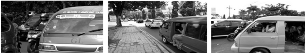
Figure 1: The city car shape and its freight and road passenger density

The transportation cars used are an All Purpose Vehicle (APV) car with an engine volume of 1600 cc (Figure 1). Interior design is the front seat could be occupied by two passengers and on rear vehicle capacity is approximately 10 passengers. There are also an additional seat for more passengers. A medium sized load speaker is also mounted on rear passenger room. A Compact Disk (CD) player is mounted on driver dashboard and also a small load speaker and another box for storing other things.