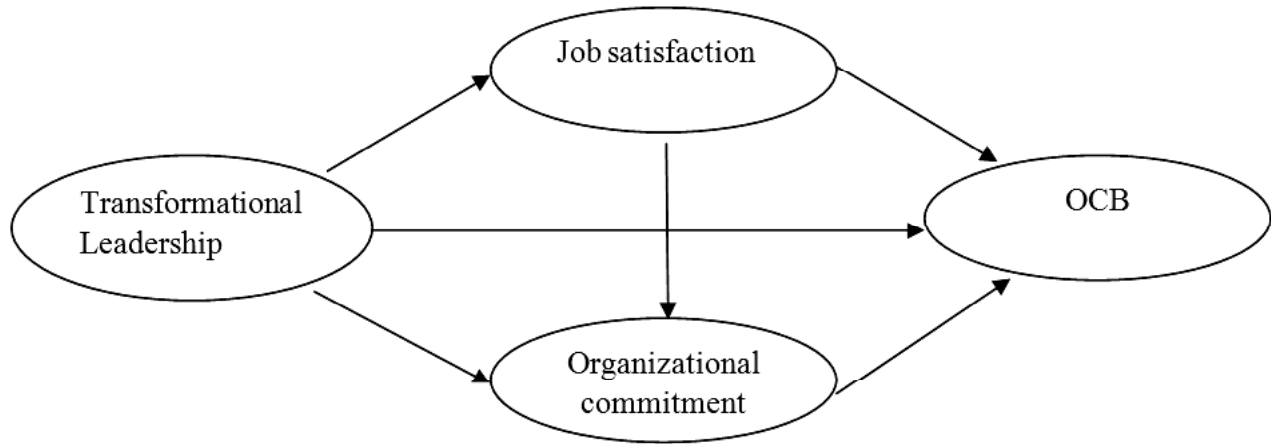
Figure 1: Research model

Based on the research model, the research hypothesis can be proposed below.