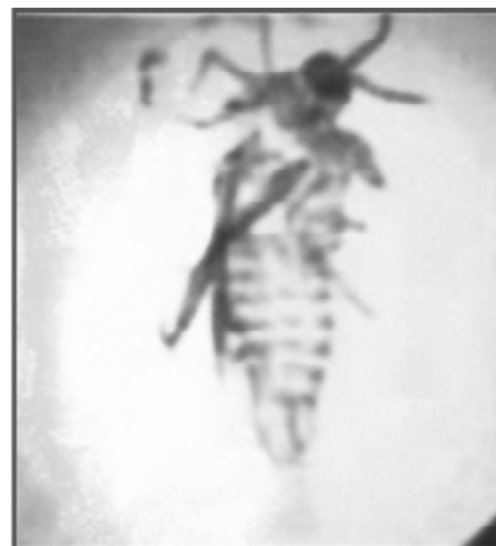
(b) Mycosis on thrips by B. bassiana