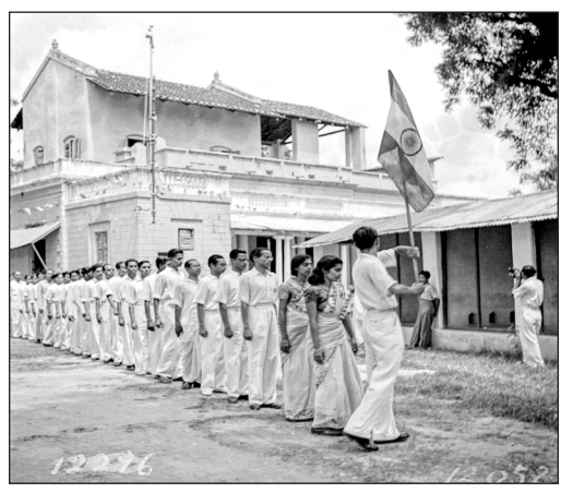
Figure-2: Celebration of the First Independence Day at Kaizer Cassel premises.

jhanda uncha rahe hamara, uncha roheyga triranga hamara . My mother had a beautiful voice. She played musical instrument and sang with us. It was very exciting moment. It was very good introduction in patriotism'.