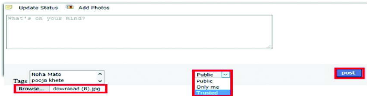
Figure 1: Posting of an information to ‘Trusted’

For the realization of proposed approach a prototype an online social networking site “Friendsbook” ( http://45.127.101.22/friendsbook/ ) with features similar to facebook have been developed. 106 users were registered on this OSN. To determine the effectiveness of proposed approach, some test cases are discussed next. • Test Case 1 The user selects the information to be shared with ‘trusted’ user having option such as ‘public’, ‘only me’ and ‘trusted’ as shown in Fig 1.