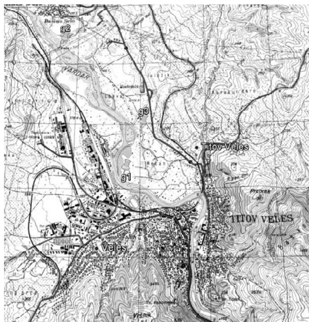
Figure 2: The Map of the city of Veles with the Garden Locations (G1, G2, G3)

Lettuce and carrot samples were chopped in small pieces and dried slowly, not directly to the sun. After drying samples were stored in clean and dry plastic bags before the analysis.