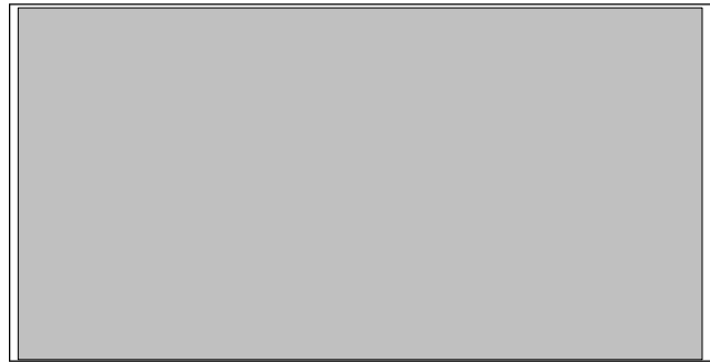
Figure 4: Content of Cd, Pb and Zn in Dry Wash and Unwashed Carrot from three Different Gardens

The content of these heavy metals in carrot samples were also very high (Table 4, Fig. 4). The content of Cd in unwashed sample was in the range from 1.58 to 2.44 mg kg -1 , for Pb from 6.61 to 10.36 mg kg -1 and for Zn from 15.1 to 22.8 mg kg -1 . However, it was found that the content of these elements were not decreased significantly in the washed samples and the content of Cd was in the range from 1.19 to 2.16 mg kg -1 , for Pb from 5.04 to 7.14 mg kg -1 and for Zn from 13.9 to 23.8 mg kg -1 (Fig. 4).