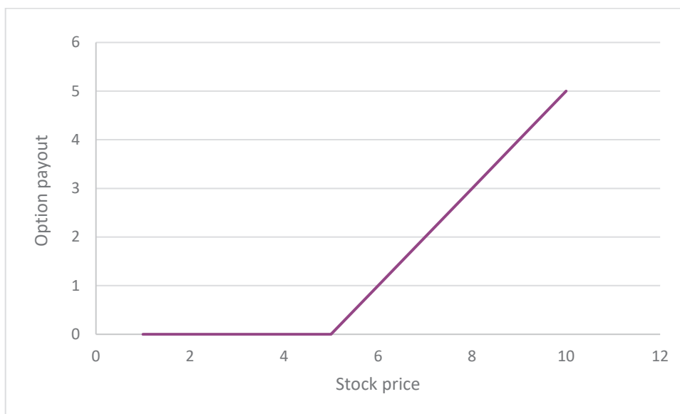
FIGURE 2. The payout of a call option, strike = 5