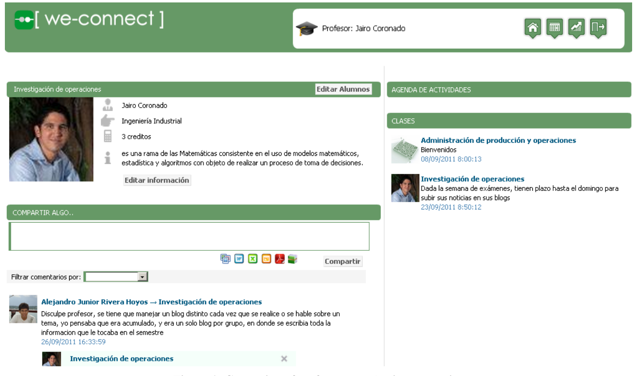
Figure 1: Course interface from a teacher's perspective