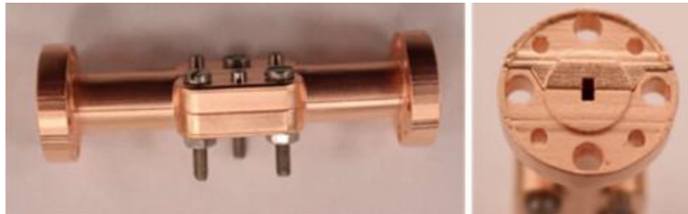
Figure 1: 3D printed and copper plated WR-10 side view and end view

lathing, shaping, brazing. There has been more research done on 3-D Printed Metal-Pipe Rectangular Waveguides (MPRWG) for different microwave frequency bands X band (8-12 GHz), W band (75-110 GHz). 3D printing offers lightweight rapid prototyping with similar performance compared to micromachining techniques. As per Mario D Auria, author of [1] 3-D Printed Metal-Pipe Rectangular Waveguides in case of commercially available MPRWG the metal pipes are reshaped through rectangular dies or with the help of CNC milling. The split block WR-10 aluminium line waveguide (75-110 GHz) series manufactured using CNC has same level of attenuation compared to 3D printed structure. [2] [4]