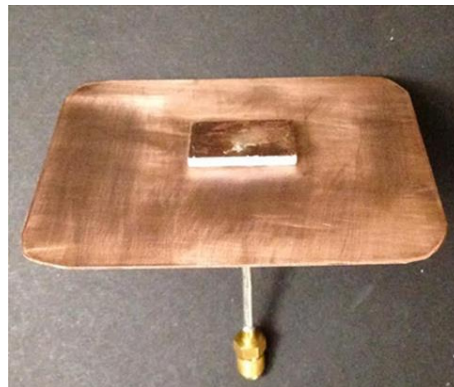
Figure 2: 3D printed patch antenna

The research by M.M.Ghazali [2] focused on multi band and narrow band 3D patch antennas which are lightweight and low profile design. This antenna which operates at 5.45 GHz has a structure consisting of a dielectric substrate called as “Vero White” is sandwiched between a metalized ground plane at the bottom and a metalized radiating patch at the top. The complete patch is fabricated in 3D printed structure and Cu metallization on one side. Figure 2 shows 3D patch antenna.