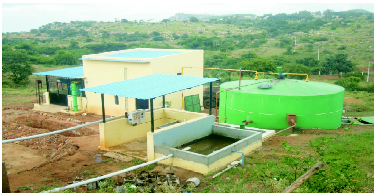
Rashthrothana Goshala-Biogas Power Plant