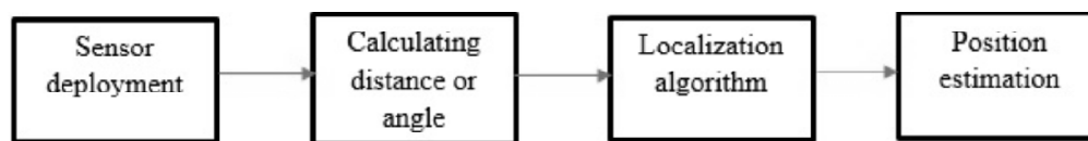
Figure 1: Localization process

Localization is the process of obtaining the location information and exchanging it among the nodes present in a sensor network. Obtaining the location information and processing it in accordance with energy efficiency, cost and scalability is a challenging aspect in wireless sensor networks [1]. Localization schemes can be divided in to range based and range free schemes. Distance and angle between the localized nodes are the two parameters that would help to track the location of any unlocalized node. Accuracy, localization error, node density, scalability and capital cost are the parameters that decide on the efficiency of an algorithm [2].