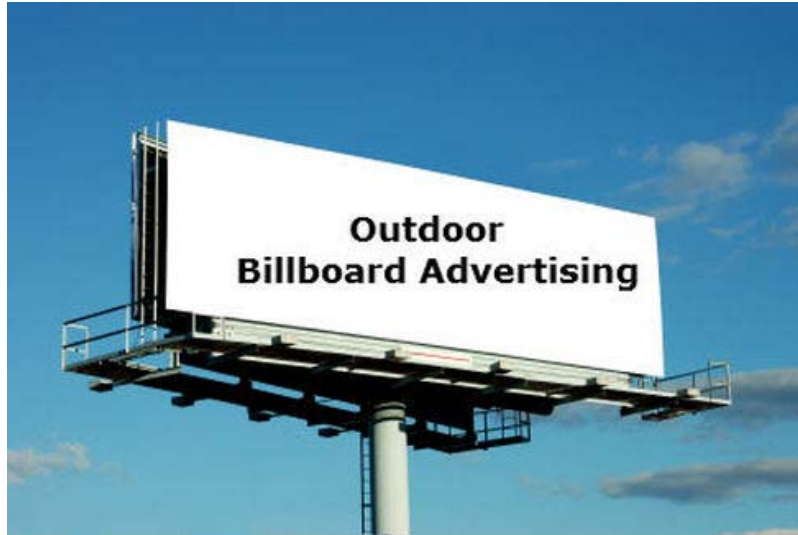
Figure 3: Billboard Advertisement [11]

The modern age of digital revolution and improving technology requires a form of advertisement or an improvement in the existing way of advertising that is cost effective and yet reaches the mass and target consumers with limited investment. It should also be easy to create and flexible to manage.