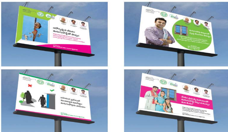
Figure2. Paper Advertisement [9]

Paper advertisement is a type of advertisement that utilizes physically printed media, for example, magazines and daily papers, to achieve buyers, business clients and prospects. Sponsors additionally utilize digital media, for example, banner promotions, mobile advertising, and promoting in social media, to achieve the same target groups of onlookers.[4] Paper advertisements include newspapers, magazine, paper hoardings as shown in Figure 2.