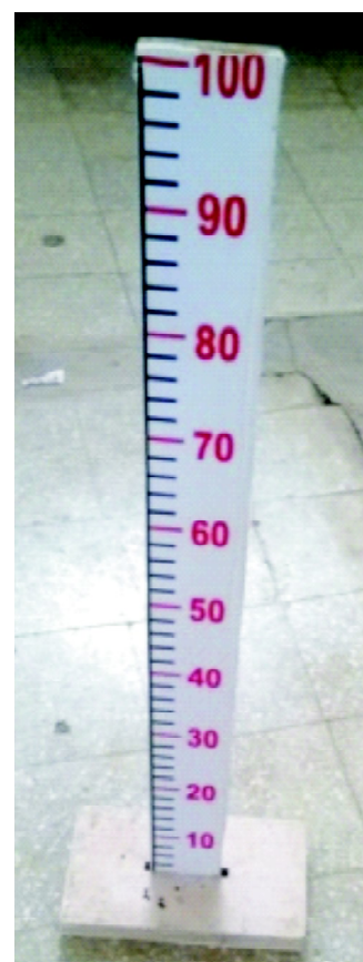
Figure 3: Vertical Splash board

The modified Morgan's splash cup was installed on a soil plot by giving the desired slope just below the sprinkling unit (nozzle). Soil plot was covered by muslin cloth of suitable size. Antecedent moisture content at pre-wetted condition was selected. Pre-wetting was done by applying water through the drain for 24 h. The pre-wet soil was immersed in the inner hollow cylinder up to full depth. The six rainfall intensities viz. 7.75, 5.8, 4.23, 2.98, 2.01 and 1.07 cm/h were selected to test the movement of splashed particles with two replications. Simulated rainfall at various rainfall intensities was continued till the runoff takes place from the soil placed in the inner cylinder of length 11 cm. The splashed soil particles from inner cylinder of modified Morgan's cup which marked the stains on muslin cloth.