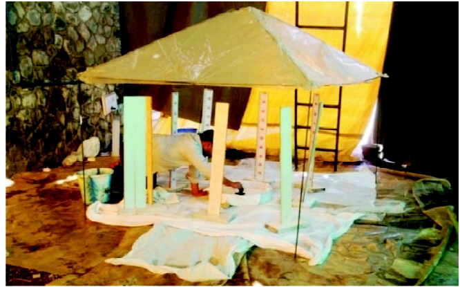
Figure 1: Complete arrangement for quantification of Splashed soil

The experimental set up consists of rainfall simulation system, modified Morgan's splash cup and cover for protecting the cup (Fig. 1).