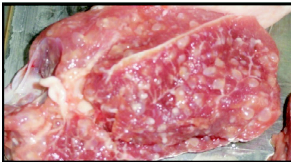
Figure 2: Cysticercus cyst sample

In view of above findings, PCR is the most suitable method for specific detection of Taenia solium in suspected cases. In this context, the present study is undertaken with the following objectives- To collect the cysticercus cyst samples of slaughtered pigs from different regions of Maharashtra and to study the prevalence of cysticercosis in pig of Maharashtra by Polymerase Chain Reaction (PCR).