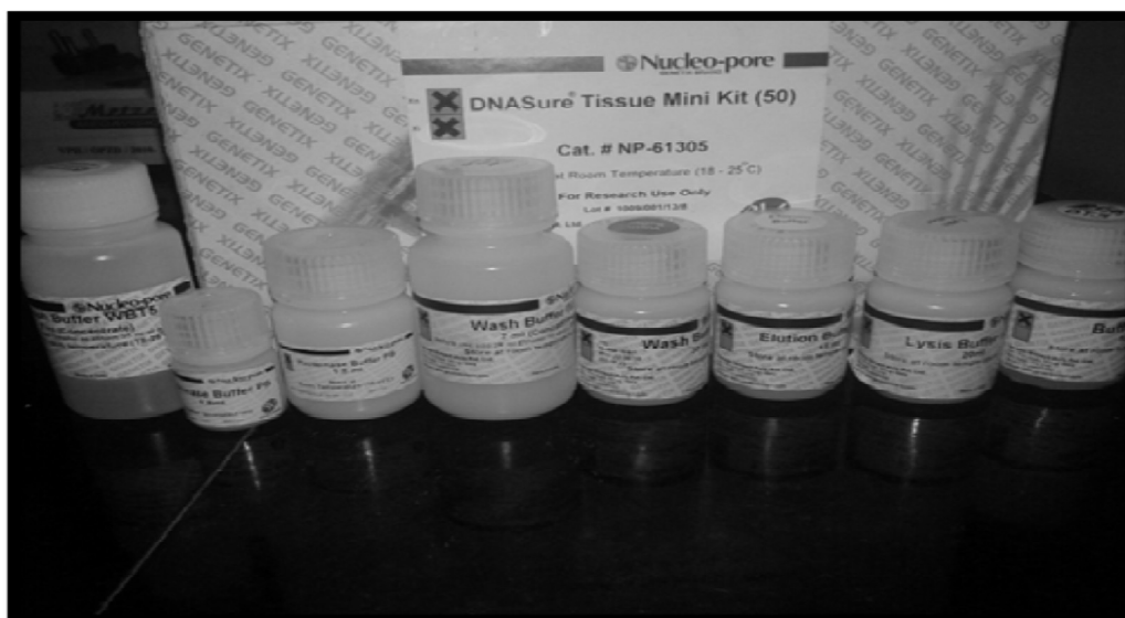
Figure 3: DNA sure Tissue mini kit