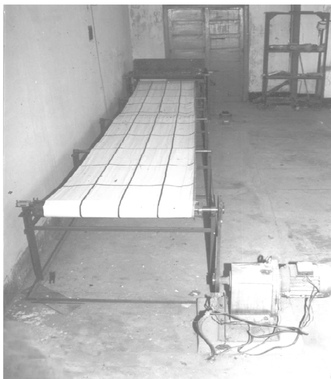
Figure 1: Test rig for metering of seeds through sticky belt