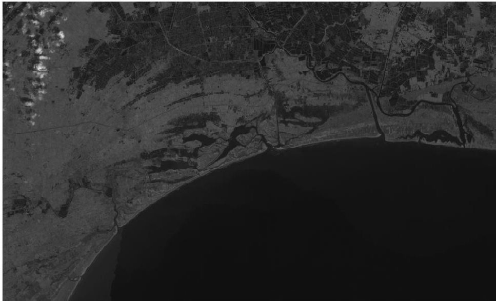
Figure 2: Study area with 23.5 Spatial data

One at a time to assess the viability of the intended way for high motion remote sensing imagery object base classification, a test is passed out on a image of pixels with 2858×3805 resolution. On the way to develop the identification rate of the subset image, a preprocessing of the image is executed alike as Pan-sharpening fusion, histogram equalization and 5X5 pixel mean filtering. Within the initial pace, the image objects are developed by mean of Fractal Net Evolution Approach segmentation. In the literature, it has determined that image characteristics alike pattern, texture and shape are useful for the high motion satellite images.