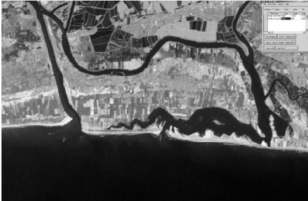
Figure 3: Training area of each class

Interpretation: Secondly, object features, engages shape, spectral and textural be intended after the segmentation. During the study, we mine the usually used object features with: 1) features of specter : maximum difference, standard deviation , brightness and layer means; 2)features of texture based on GLSDM: standard deviation, mean, dissimilarity, contrast, homogeneity, angular second moment and entropy; 3)character features: length/width and shape index; 4) The Normalized Difference Vegetation Index and The Normalized Difference Water Index