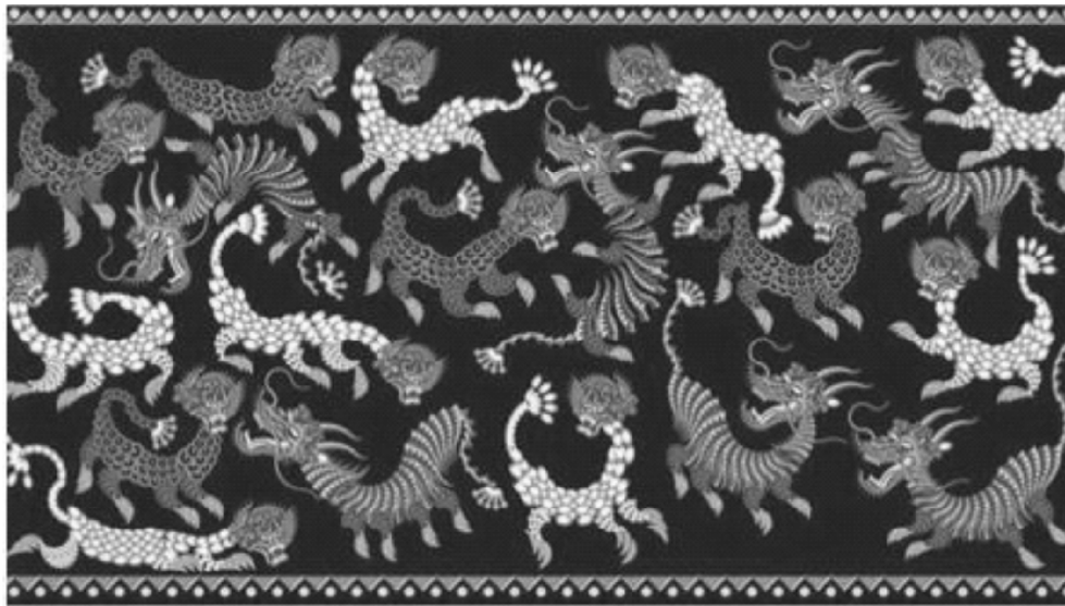
Figure 1: Design of Fractal Batik Motif

The purpose of the training of batik motif design using fractal batik software in Pro level was to improve the skill in using fractal batik software completely and integrately. It was also aimed to be able to change the parameters of the motives created and can get a variety of new shapes that have never been imagined before in three and two dimensions.