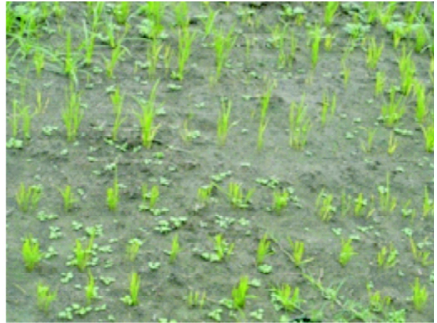
Aerobic Rice seedling stage