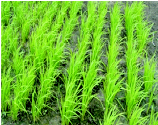
Aerobic Rice Tillering stage