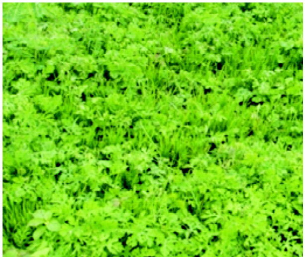
Unweeded aerobic rice plot